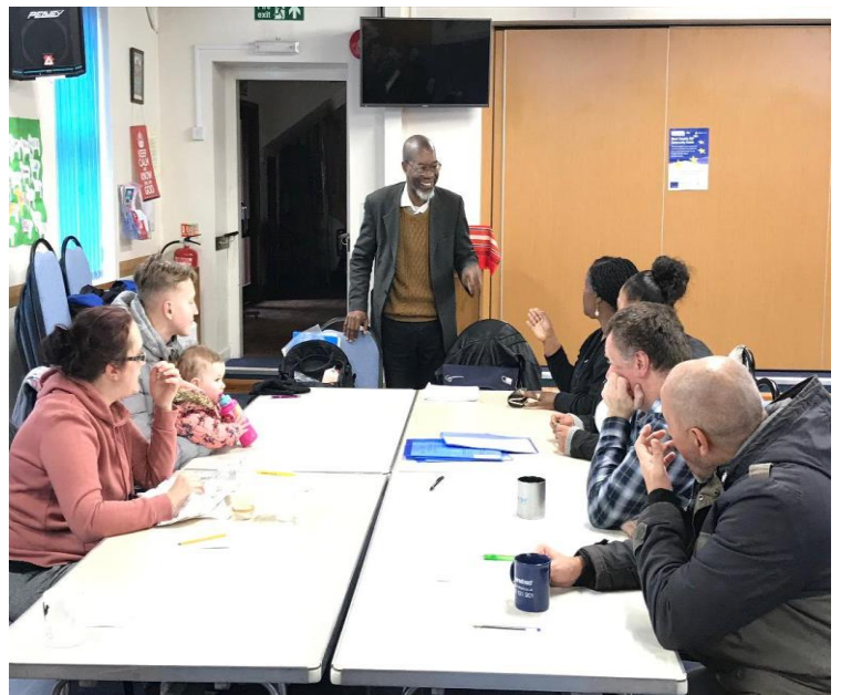
Technology resilience program in action