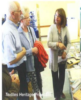
Textiles Heritage Project

In spite of increasing levels of functional illiteracy in the region, Founder/Director of CEAL,