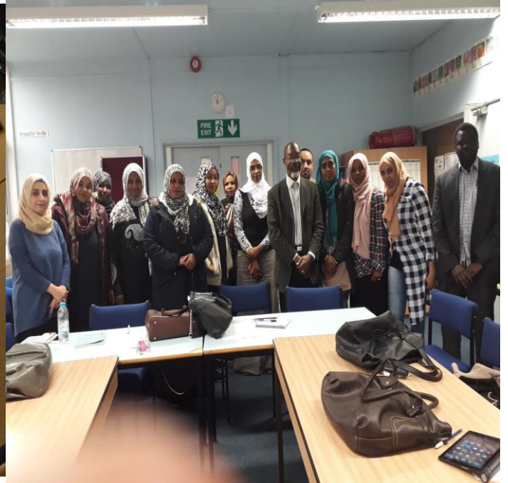
Employability Training Sandwell