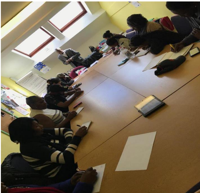
Financial Training in Wolverhampton

For years, we have been delivering high quality, innovative projects funded by the ESF and other statutory funding bodies. Here is a snapshot of some of the key training that we delivered in partnership with public, private and community-voluntary sector entities in the Black Country sub-region. These activities included financial skills, job search, enterprise development and information technology resilience programs.