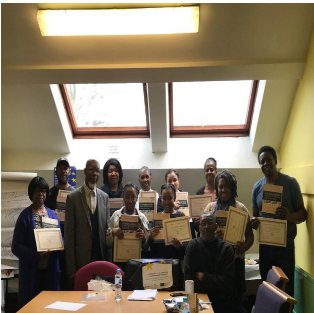
Enterprise training completed